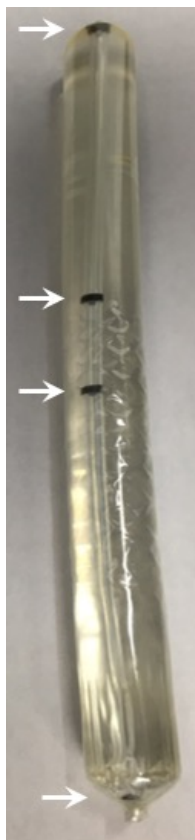
Conventional swaged marker bands in 4 locations