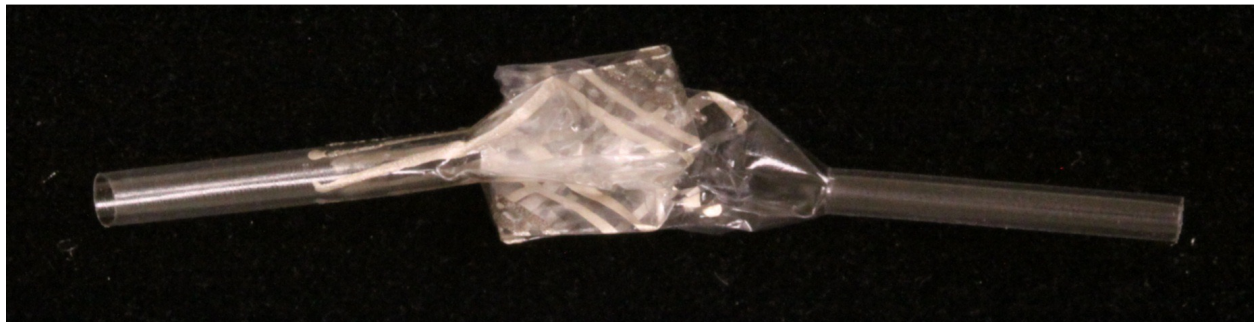
Torture test to examine ink adhesion on a medical balloon

Safety alone is an excellent reason to evaluate an alternative to swaged radiopaque markers, but there are other benefits that are more important from a functional standpoint. Micropenning is an extremely precise form of direct-write printing where radiopaque inks can be deposited on the medical device. In Micropenning, we use inks made from materials with a pedigree of medical device use and FDA approvals. Then we put them through toxicity tests as well as a torture test to be certain there can be nothing left behind. The inks have been chosen also for electrochemical stability, materials conflicts, and biocompatibility. Inks that are approved for both 30-day and permanent implants are available.